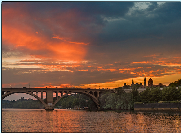
A Potomac River sunset over the Key Bridge & DC waterfront.