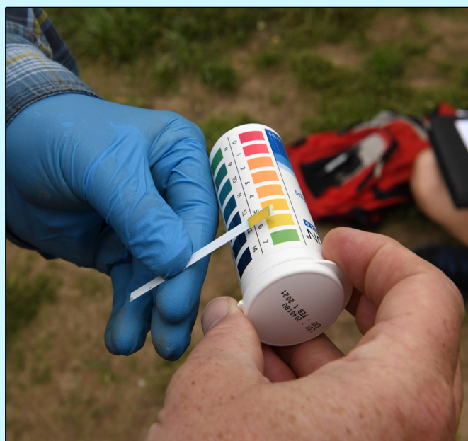
A PRKN water quality monitoring volunteer testing pH of a Potomac River tributary.