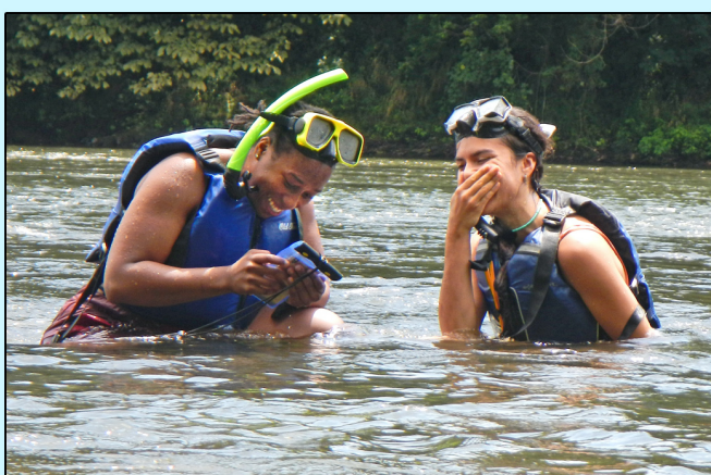
Above: A group of participants enjoying RioPalooza, our hispanic heritage river celebration..