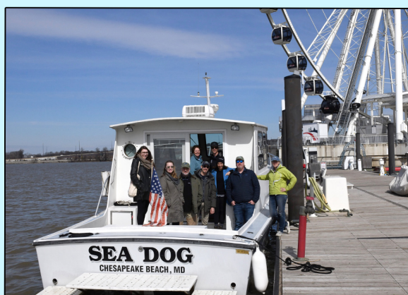
The Potomac Riverkeeper staff aboard the Sea Dog.