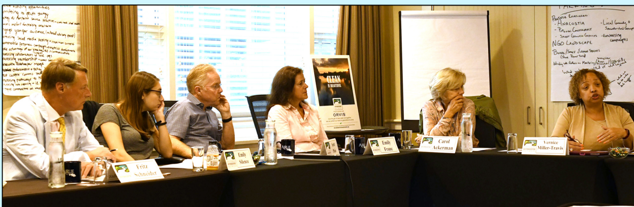
Board Members and Staff at the 2019 Strategic Planning Retreat.