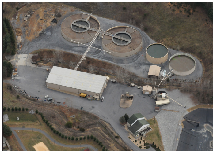
Above: Massanutten Sewage Treatment Plant aerial

The importance of halting trading at this facility cannot be overstated. For the past five years, the Shenandoah Riverkeeper has been working relentlessly to get all three reaches of the Shenandoah River placed on Virginia's Impaired Water List, due to nutrient pollution and algae blooms – with little support from DEQ. It has been particularly frustrating to see this facility annually exceed their permit limits for nitrogen and phosphorous and exacerbate an already challenging and persistent algae problem.