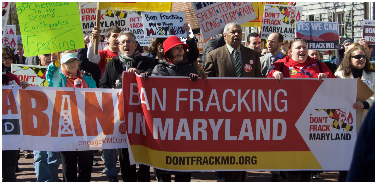
On March 2nd, over a thousand people came to Annapolis for the Don't Frack Maryland March

MARYLAND BANS FRACKING! A VICTORY FOR THE PEOPLE!